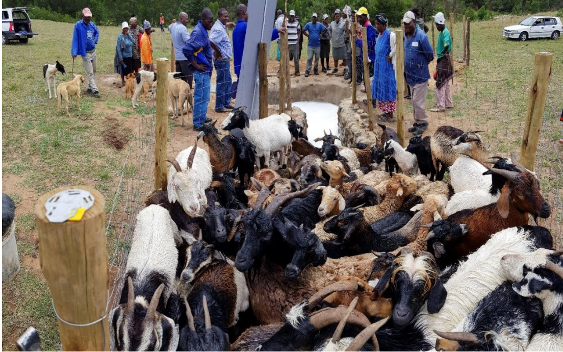
A goat dip tank – in Msinga some 900 goats get dipped on a goat dip day