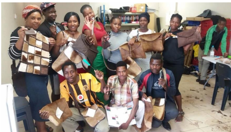
Leather CAHWs trained on making bags and pouches

The project will create microbusinesses for local unemployed youth who will support farmers' productivity with these businesses. These young people will broadly be known as Community Animal Health Workers (CAHW). They will be trained up and given equipment to set up their small businesses.