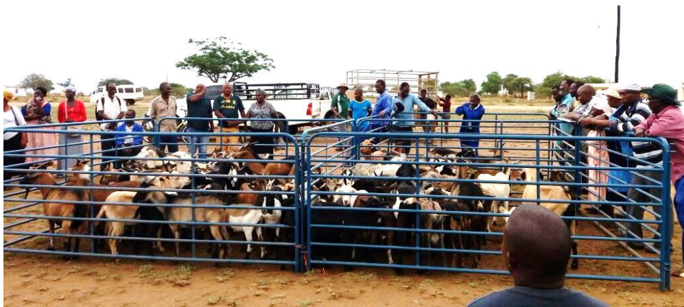
A goat sale launch at Nongoma