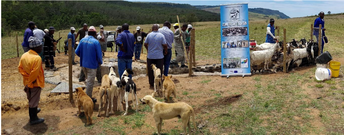
A goat dip tank launch at Msinga Top

Part of this will fall to the DARD budget in terms of research but as well as some stipends for CAHWs who are supporting the research.