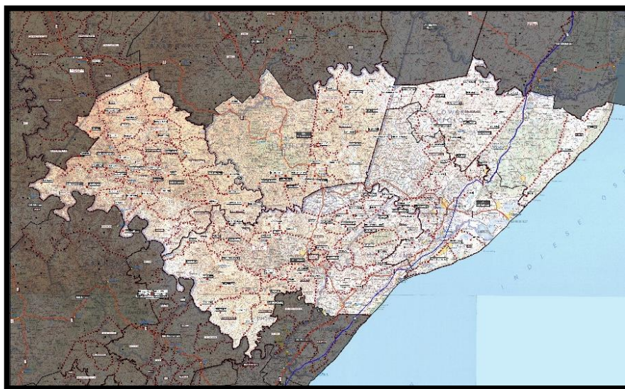
The King Cetshwayo Municipality showing dip tank sites

The GAP project was invited to present the GAP program at the Agriparks meeting in Richard's Bay and there seems to be increase interest in the whole Agriparks concept to include goats into the model. GAP needs to model how they would interface with these government initiatives. Our work in Vulamehlo has proceeded to a point where we have agreed on running this area as a pilot between us and the Department of Agriculture and the Office of the Premier. GAP believes that this sort of partnership should be a way of us scaling goat commercialisation without us having to revisit the whole programme in terms of budget and staffing.