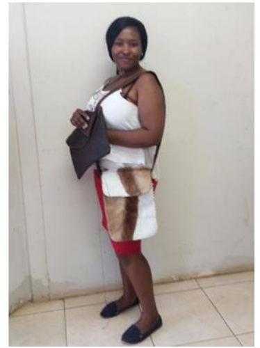
Leather CAHWs show of the products they have made