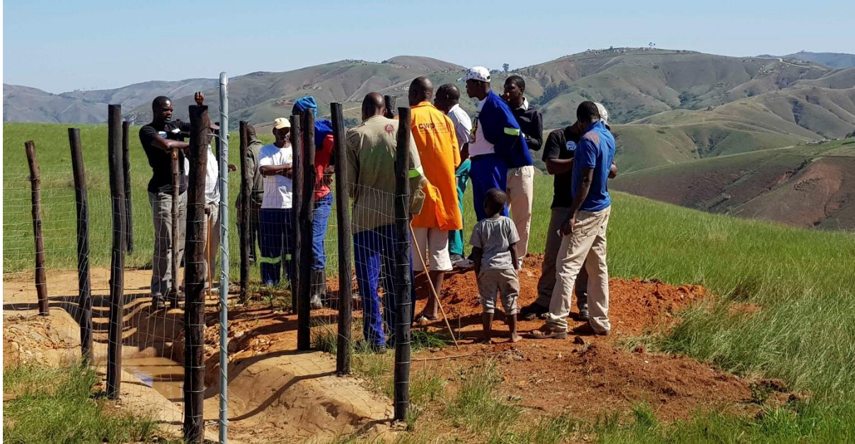
Preparing the dip in Nkandla for a farmer exchange visit

The DRDLR in King Cetshwayo Municipality jointly arranged a meeting with the GAP program and the LA representatives to renegotiate the dip tank expansion for 2018. This meeting was very productive. We presented the GAP program. Many of the areas that we had not started working in expressed interest in taking part in the auctions and having the GAP program presented at their local Livestock Association meetings so that they could start working towards some sort of collaboration.