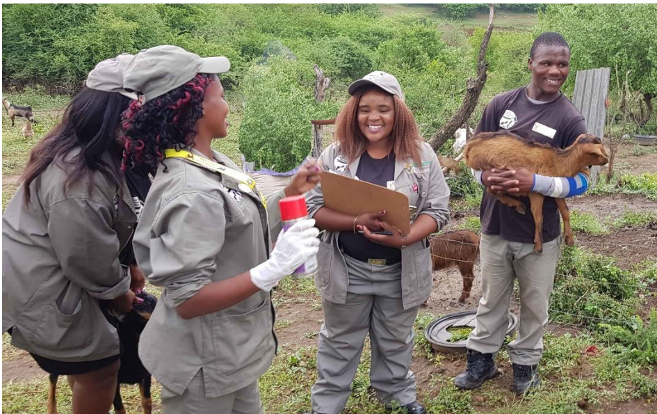
CAHWs treating at a farmer's yard during the Wesbank visit

The total number of CAHWs we currently have are 160 paravet CAHWs (including 22 funded by NGOs) and 29 leather CAHWs. We have 80 dips we are working with. The target for year 2 is 65. We have delivered supplemental feed set up kits to the 25 new dips.