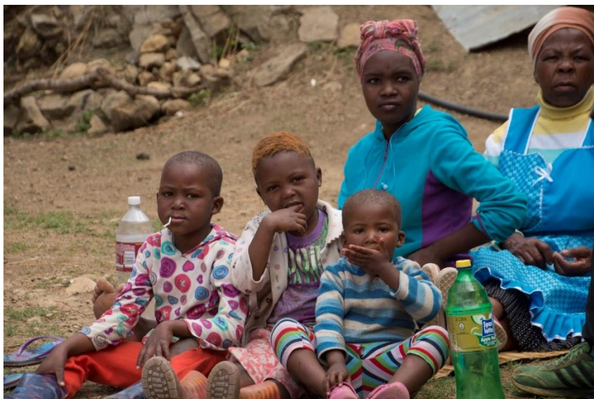
Children attend a chicken vaccination and goat training

The third quarter has been focusing on training of dip tanks and related groups. We have 172 of the groups. They are being formalised- the numbers and details of membership. There were 1 071 trainings from October to December all AgriSETA compliant.