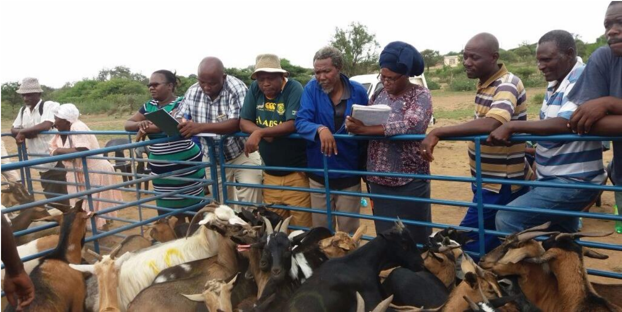
The Hlabisa monthly sales yard

business away from them. To this end, we are implementing a system where the CAHWs will produce invoices showing they have bought medicine themselves from local suppliers and the project will give them the equivalent of what they have bought from the project budget through the vet shop. The plan is to give 3 of these top ups.