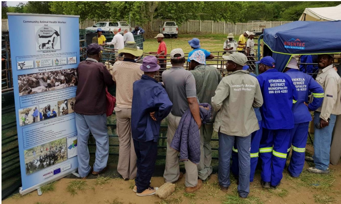
The first Uthukela auction in Weenen

During this quarter, an auction was held in Weenen, a first for the Mzinyathi area since the inception of the project. 216 goats were sold for R232,000 rand. This auction went reasonably well although the goats were not in very good condition at the end of the 3-year drought. A follow up sale, as reported above, is currently being planned.