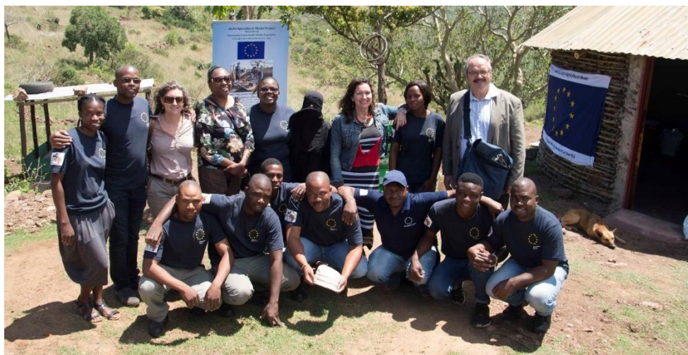
The European Union visits the Jozini project area