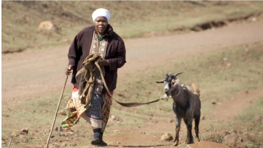
A Jozini project member brings a goat needing attention to a CAHW training