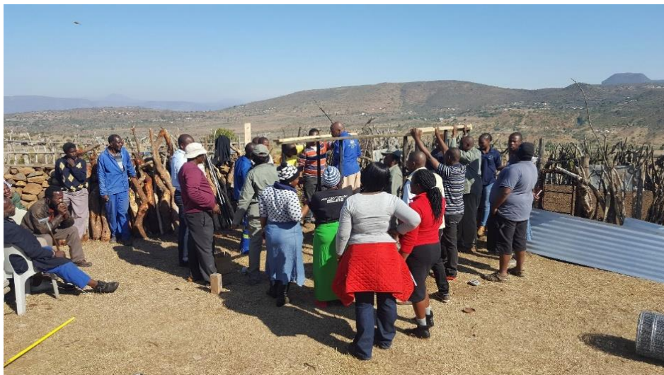
Staff from the gAP project working on an experimental goat shelter in Msinga

A staff exchange visit was held in Msinga with HPSA staff, MRDP staff, local Livestock Association and DRDLR officials. The purpose of the visit was to jointly make enclosure in a farmer's yard so as to get consistency across all project areas in what an enclosure looks like and how it works. Milling stover was also practiced.