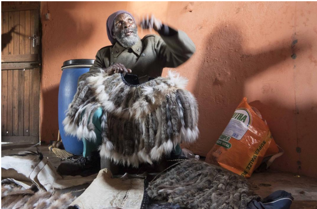
A leather worker explaining the use of goat skins in traditional craft in Jozini

40 CAHWs have been identified to take up leather processing as a microenterprise. It has been difficult to find and negotiate the training of these young people as the current leather training courses are either year long trainings or 3 month trainings aimed at the state which resultantly are costed way out of the budget. The current service provider, Simx Oram, will provide a SETA approved short training course on leather which will be a start towards a longer term training. Once we have been able to see how useful the first training has been. The first training will be held in Dannhauser the week of 26 th September.