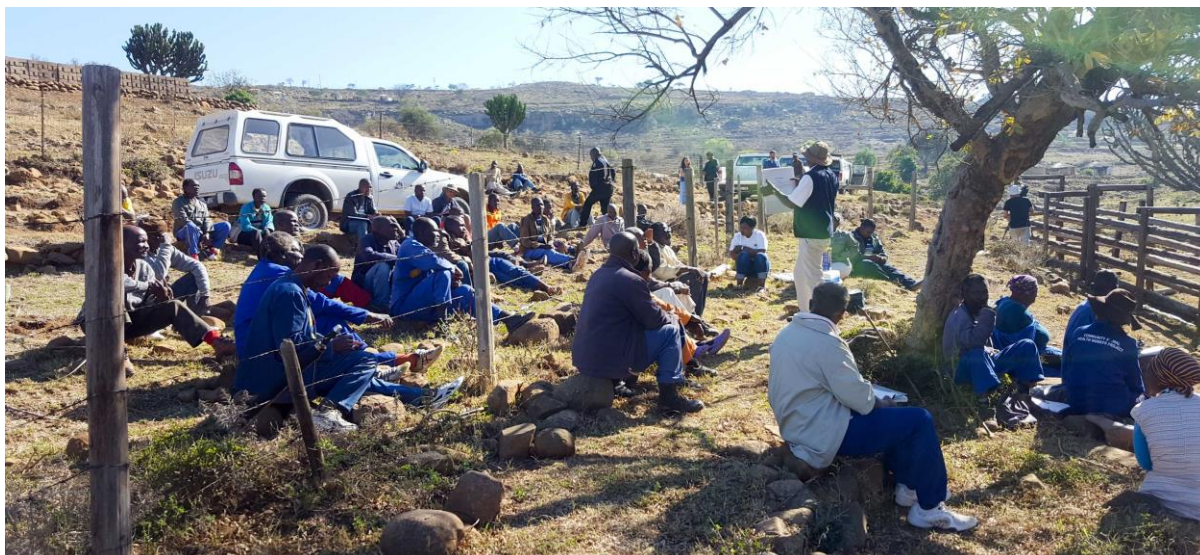
A dip tank training using the training calendar

There has been a huge interest in the project and as a result many structures and NGOs setting up parallel products and processes. The project was able to get out in front of the drought in terms of rollout of energy blocks being made and distributed by CAHWs.