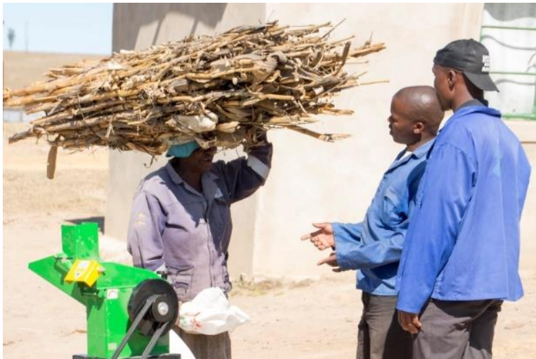
A farmer from the Nkandla area bring stover to the CAHW for processing

Pending the discussions with the DRDLR on their responsibilities towards the payment of stipends, we are recruiting the other 3 CAHWs per dip tank to do leather works and further support farmers. We also plan to hand over the vet kits in this coming quarter post a process to test CAHWs' proficiency together with Livestock Associations and the Vet Department.