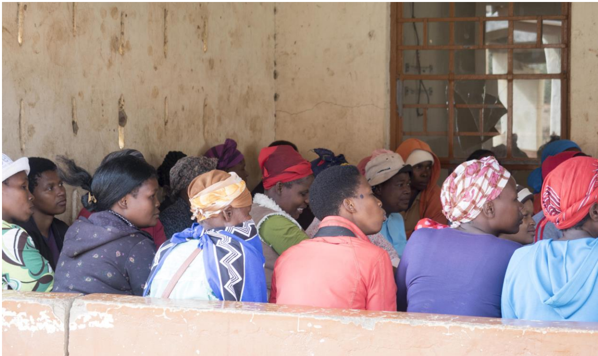
A goat farmer training in Jozini mostly attended by women farmers

Nonetheless, as the need for SETA approval seems to be something that will assist DRDLR, the project has embarked on a process of gaining SETA approval for all their training curriculums and products.