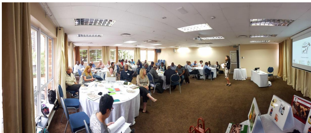
The inaugural innovation platform

The first innovation platform was held in April during the last quarter. The report is attached. It was well attended by 40 stakeholders. A number of priority issues were identified and agreed to. From this list a second innovation platform will have been held on 28 to 29 September 2016 in the field looking at specific problems with African goat herds in Zululand homes. We will then present the findings to the larger group at the next innovation platform. The research component of the project is being negotiated with DARD in the draft SLA.