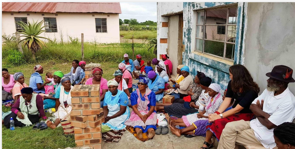
A farmer's day in Jozini project

Research is funded through the DARD funding, which has not arrived this year, however the two NGOs have been funding these activities from their own funding reserves.