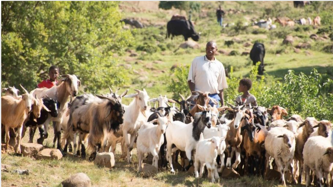
A project member and his sons bringing goats to Dungamanzi goat dip