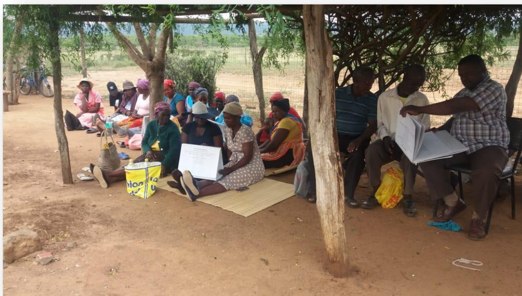
Farmer theme day at Mboza, uMkhanyakude

Various small farmers have approached GAP from the Empangeni area to request support of training and extension in their commercialisation efforts. Although GAP does not have a presence there, we do work closely with the Owens Sithole Research Station who we have approached to set up a training and demonstration site of GAP's interventions which we would use to support local farmers after a training process and link them with Owen Sithole staff who could provide close extension support.