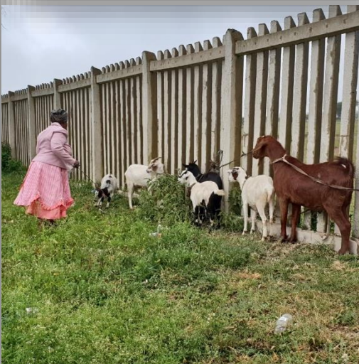
Various forms of mini sales have been happening

project partners and enterprise owners on the current years planned activities as well as make them aware of ongoing work and achievement as well as challenges. The farmers also gave their feedback and highlighted challenges and problems.