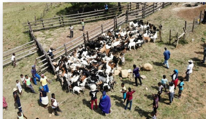
The whole family is needed to take the goats to the dip

The project will create microbusinesses for local unemployed youth who will support farmers' productivity with these businesses. These young people will broadly be known as Community Animal Health Workers (CAHW). They will be trained up and given equipment to set up their small businesses.