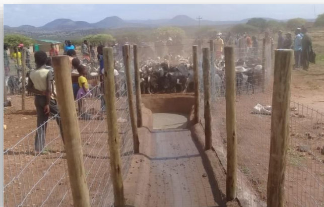
The piloting of dip tanks is a great success in reducing mortalities in summer