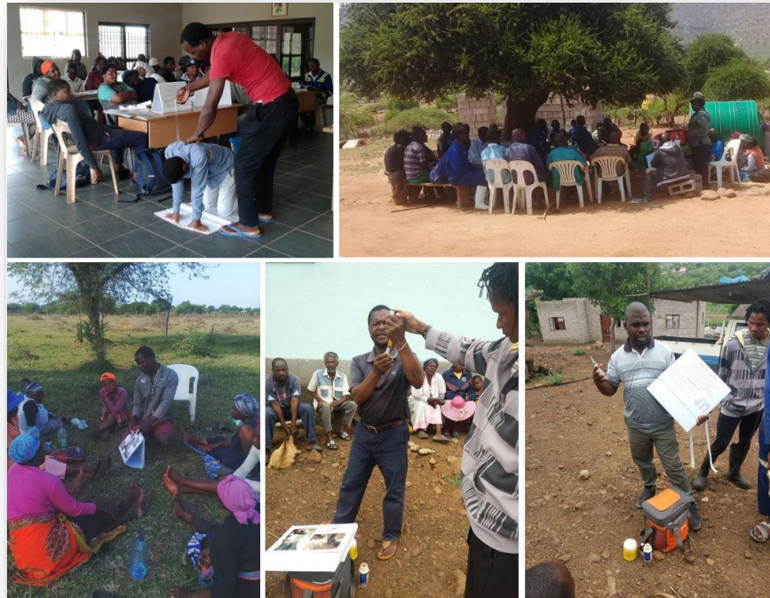
Trainings happen where it's convenient for farmers and project members

writing this report, GAP NGOs had not had feedback on whether or not they had been selected to be part of the panel.