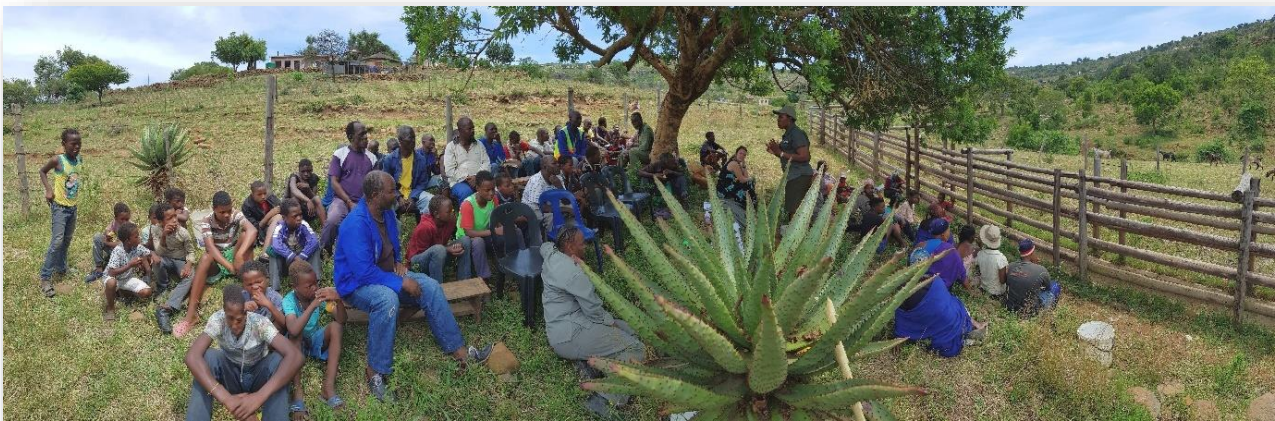
Trainings at dip tanks involve all livestock owners and herders

The second model focused on paying the CAHWs for a variety of activities such as preparing goats for mini-sales by tattooing and deworming them. These CAHWs went out to the farmers inform them of the sales and got them to commit their goats to the sale. This way we could give buyers ideas of how many goats will be at any particular sale and attract more buyers and get better prices for the goats on show. In this model, they were also paid for their support of activities related to GAP in the field and these include DARD at dip tanks, theme days, farmer trainings, goat dip days, stover processing and supporting experiments.