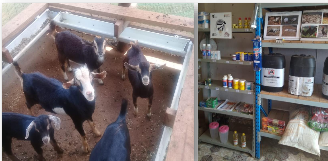
Goat enclosures and Agrivet shops were visited as part of ongoing monitoring

As reported in the previous quarter, the five Eshowe/Nkandla 2018 dip tanks were in suspense because a disagreement about the verification of census results. A meeting was held on the 6 th of February with municipal staff and all GAP partners and Livestock Associations in Eshowe. At this meeting, it was resolved that these dips be given another chance and a process of reconciliation be started by Rural Development officials facilitating a meeting between GAP and the Livestock Association (LA). The LA committed to resolving the tone of process to date and finding replacement CAHWs. The LA would also approach the traditional authorities and inform them of the problem and agree to restart the relationship. A further two dips will be identified in the thorn areas in Eshowe and three in Nkandla. These would then be the new 2019 King Cetshwayo dip tanks.