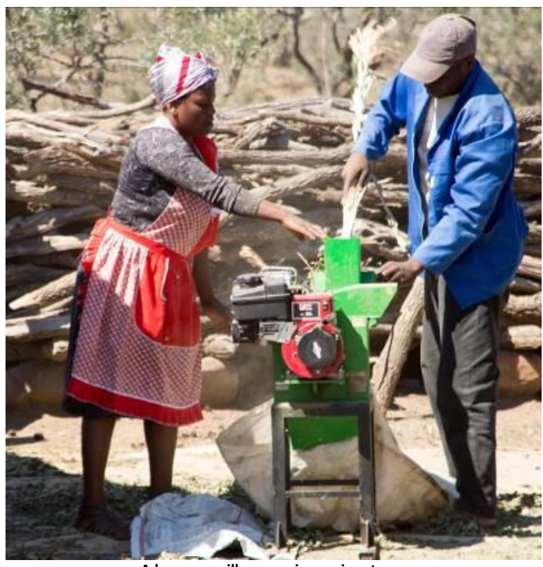
A hammermill processing maize stover