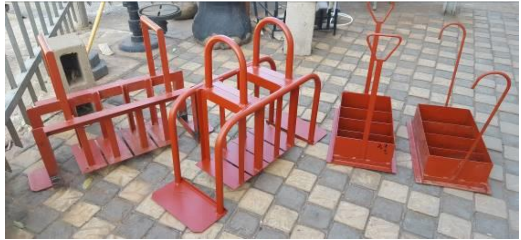
The adapted brick maker