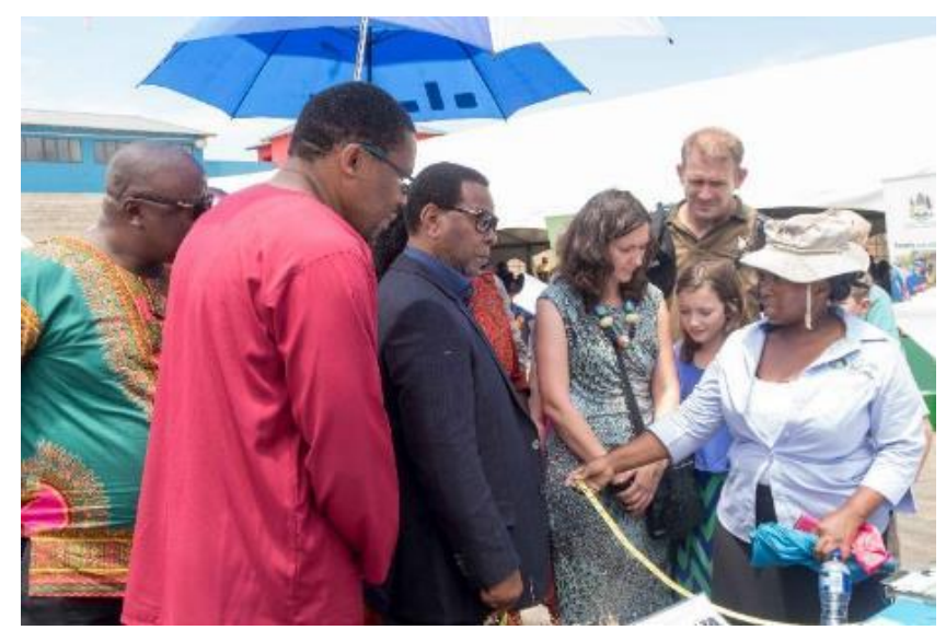
The Zulu King is shown some of the joint products developed for the Goat Agribusiness Project