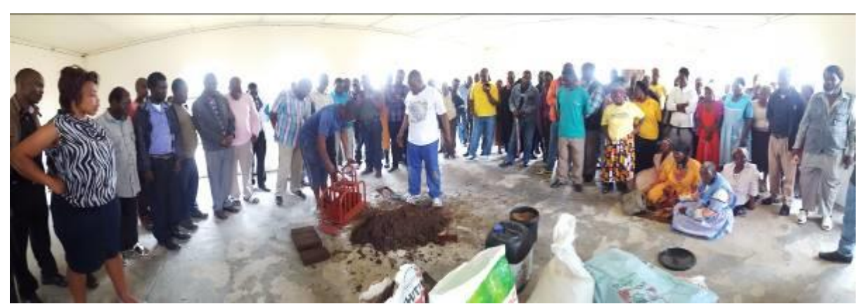
A training demonstration at Mhlabuyalingana

At each area a training was held with the local youth and farmers to promote the product and initiate demand for the blocks to feed goats. A brickmaker at every dip tank where the work will start is being scaled out. Trainings involve using mix ingredients and offering samples to farmers to try out on their livestock and a small stock of bricks to start selling.