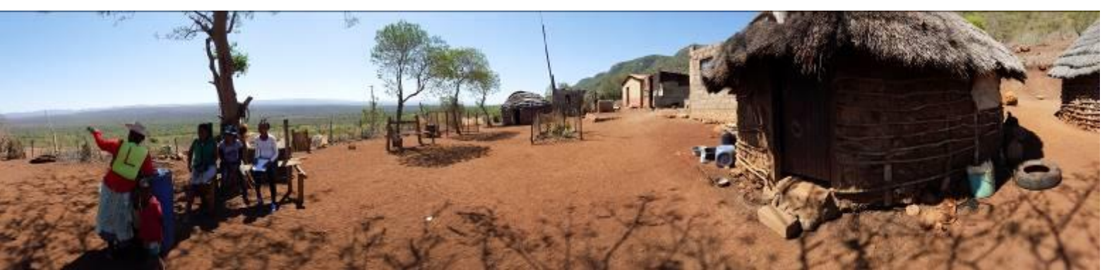
Doing a census in the Jozini area

will be revisited as the project progresses to measure changes in these trends and linked productivity. This process was done after the consultation process described above with necessary stakeholders. Two local youth per dip tank were trained in census taking and paid a stipend to collect information. These young people are to be integrated in the future job creation part of the goat agribusiness project.