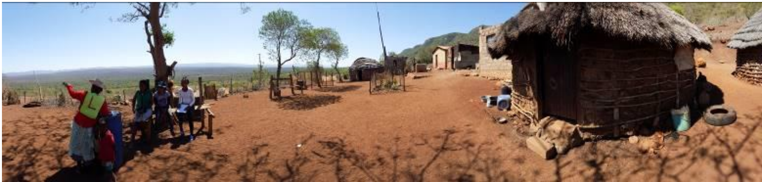
Doing a census in the Jozini area

will be revisited as the project progresses to measure changes in these trends and linked productivity. This process was done after the consultation process described above with necessary stakeholders. Two local youth per dip tank were trained in census taking and paid a stipend to collect information. These young people are to be integrated in the future job creation part of the goat agribusiness project.