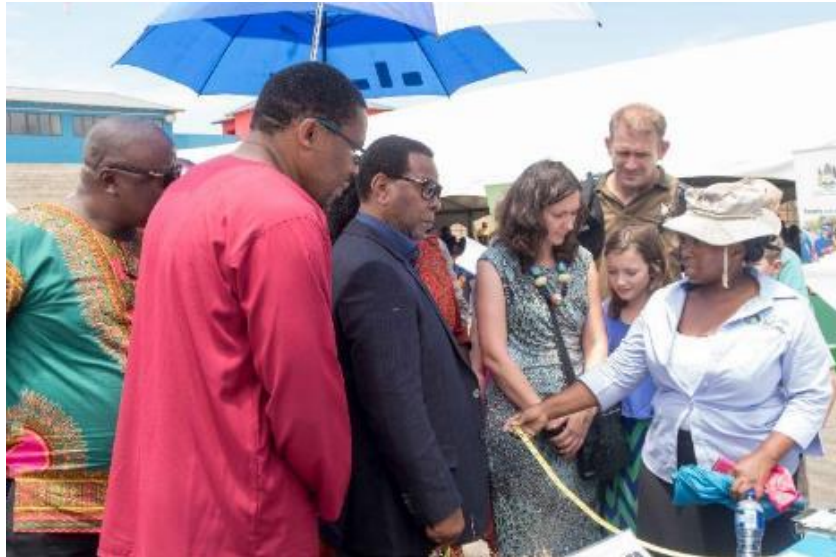
The Zulu King is shown some of the joint products developed for the Goat Agribusiness Project