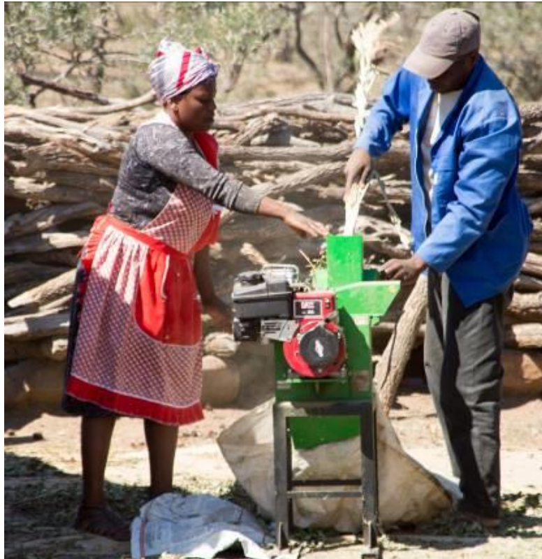
A hammermill processing maize stover