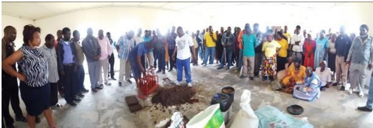
A training demonstration at Mhlabuyalingana

At each area a training was held with the local youth and farmers to promote the product and initiate demand for the blocks to feed goats. A brickmaker at every dip tank where the work will start is being scaled out. Trainings involve using mix ingredients and offering samples to farmers to try out on their livestock and a small stock of bricks to start selling.