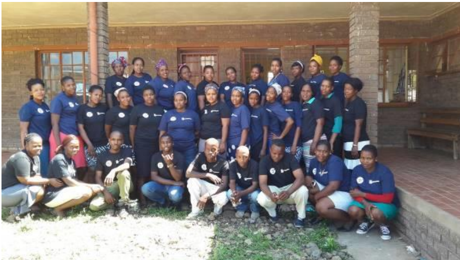
The Goat Agribusiness CAHW finishing a training

The Community Animal Health Worker training has started with 40 CAHWs getting two, week long trainings in the Mzinyathi and Thukela areas. There have been two trainings in the Nkandla, Zululand and Jozini areas with 38 CAHWs. Training in both of these areas has been in the Goat Agribusiness concept, Community Animal Health Worker concept and basic animal health. More trainings are planned in the next months.