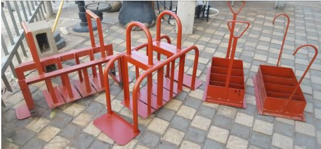
The adapted brick maker