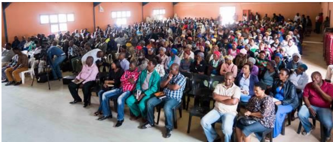
A drought feeding meeting with Msinga goat farmers

The KZN Goat Agribusiness project has been started in the 5 District Municipalities as was planned. The project has been adopted by the KZN Department of Agriculture. A meeting with Msinga goat farmers was held to discuss and promote the goat energy blocks, which are made and sold by Community Animal Health Workers (CAHWs), as a drought management measure. This meeting led to the Goat Expo and Goat Dish Competition where MEC Xaba and the Zulu King Zwelthini jointly launched the project. Premier of KZN Mchunu turned the sod of a goat abattoir that forms part of this project the following week. See report attached.